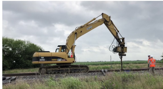
Geopier GeoSpike SM being installed to treat weak railroad subgrade without removing track, ties or ballast