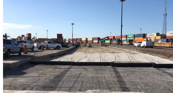
Tensar geogrid increases the speed of construction, reduces labor and equipment costs and over-excavation of poor soils.

The benefits of using our company's products, services, applications and/or systems result in faster, stronger and more economical solutions that save time and money when compared to conventional alternatives.